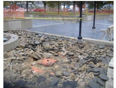
Peoria Courthouse Plaza Renovation - Before