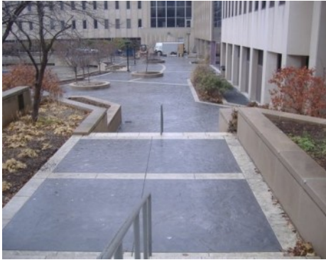
Peoria Courthouse Plaza Renovation - Imprint Systems English Slate Texture