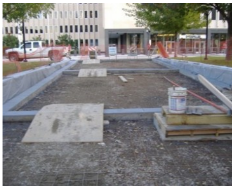
Peoria Courthouse Plaza Renovation - Before