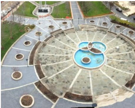
Peoria Courthouse Plaza Renovation - Imprint Systems English Slate Texture