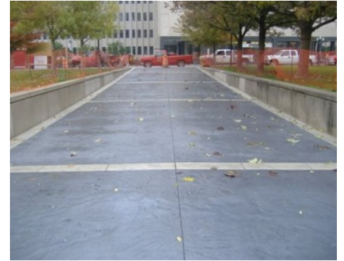
Peoria Courthouse Plaza Renovation - Imprint Systems English Slate Texture