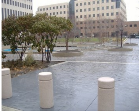
Peoria Courthouse Plaza Renovation - Imprint Systems English Slate Texture