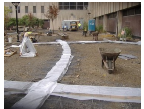
Peoria Courthouse Plaza Renovation - Before