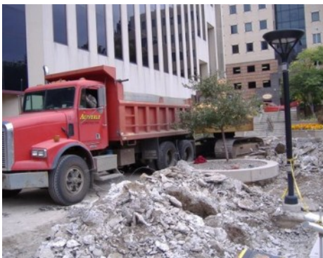
Peoria Courthouse Plaza Renovation - Before