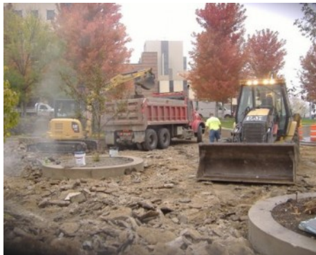
Peoria Courthouse Plaza Renovation - Before